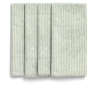
Napkins (set of 4) Stripe Sea Foam 100% Cotton