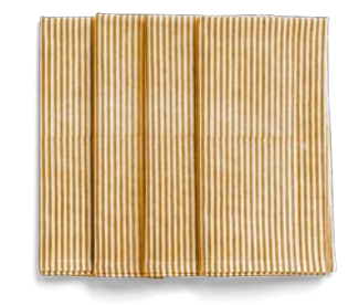
Napkins (set of 4) Stripe Lion Yellow 100% Cotton

CA2887 – 160 x 160 cm CA2888 – 150 x 230 cm CA2889 – 170 x 270 cm CA2890 – 150 x 350 cm