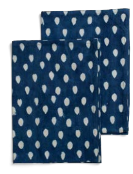
Kitchen Towels (set of 2) Indigo Drop 100% Cotton