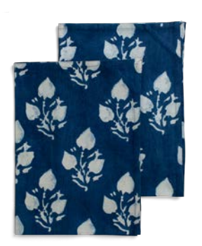
Kitchen Towels (set of 2) Indigo Leaf 100% Cotton

CA2969 – 150 x 230 cm CA2970 – 170 x 270 cm CA2971 – 150 x 350 cm