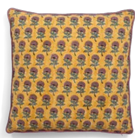
Cushion Cover Sunflower Yellow 100% Cotton