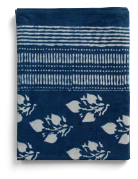
Tablecloth Indigo Leaf 100% Cotton

CA2966 – 150 x 230 cm CA2967 – 170 x 270 cm CA2968 – 150 x 350 cm