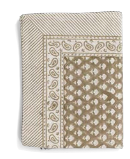
Tablecloth Fiori Light Brown 100% Cotton

CA3020 – 120 x 120 cm CA3018 – 150 x 230 cm CA3019 – 170 x 270 cm