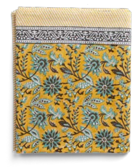
Tablecloth Indian Summer Yellow