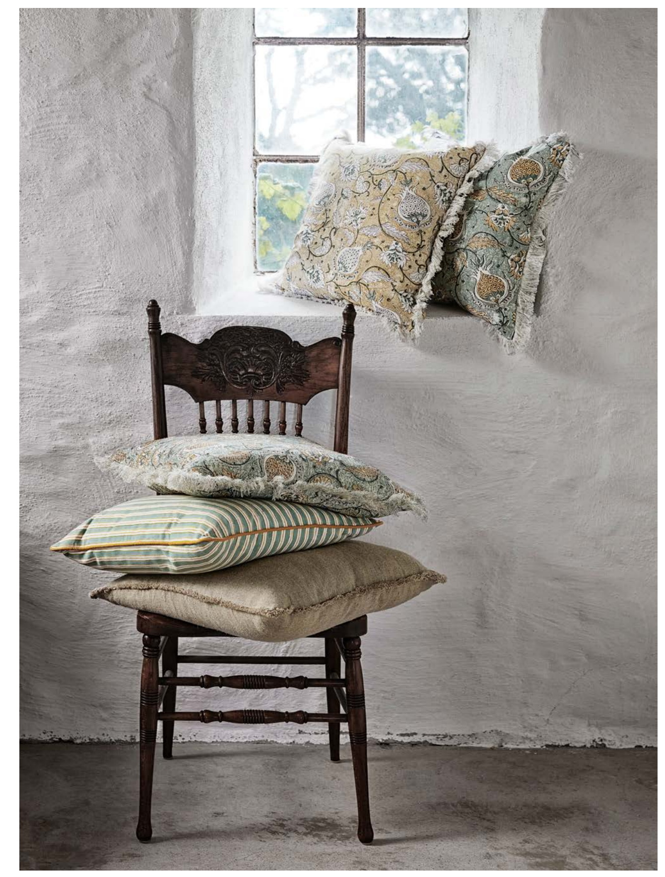
Above: Pomegranate Sea Foam comes with cushions in both linen and cotton.