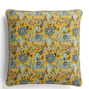
Cushion Cover Indian Summer Yellow 100% Cotton