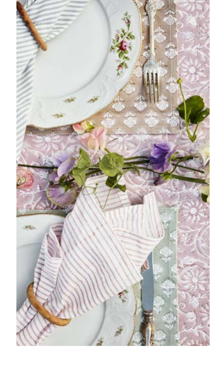
26 News in Memories