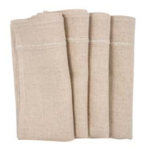
Napkins (set of 2) Natural Beige 100% Linen