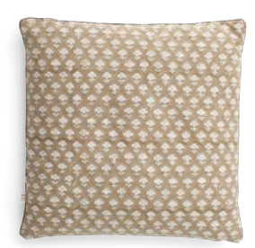
Cushion Cover Fiori Light Brown 100% Cotton