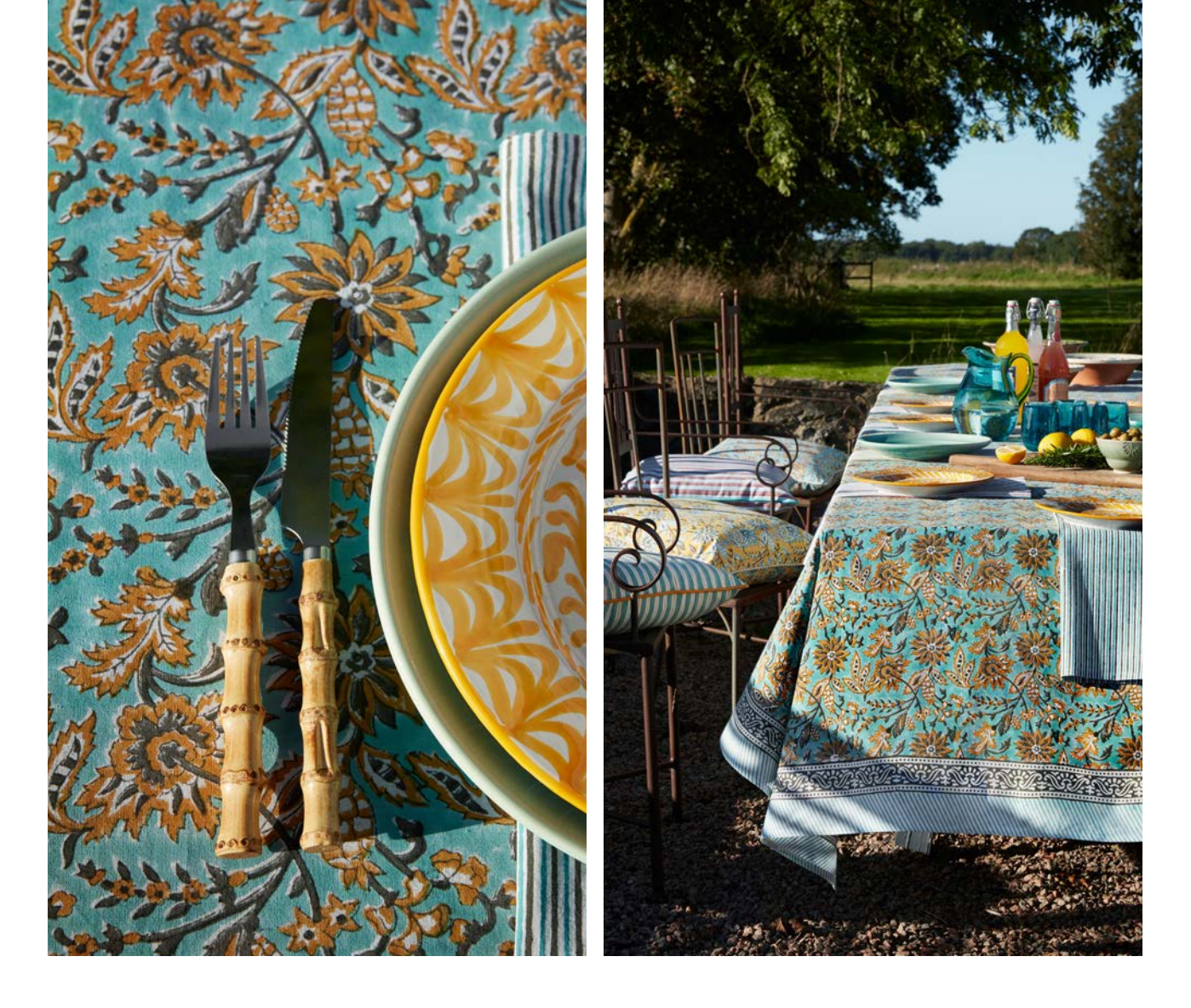
Bright and colorful, the Indian Summer collection is perfect for warm summer days. Mix the different colors together and create a fun and playful atmoshphere.