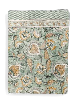
Tablecloth Pomegranate Sea Foam 100% Linen

This year's new textiles in the Pomegranate print.