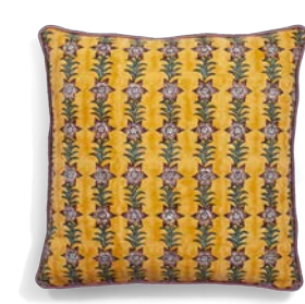
Cushion Cover Garland Yellow 100% Cotton