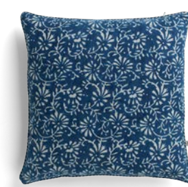
Cushion Cover Indigo Aster 100% Cotton