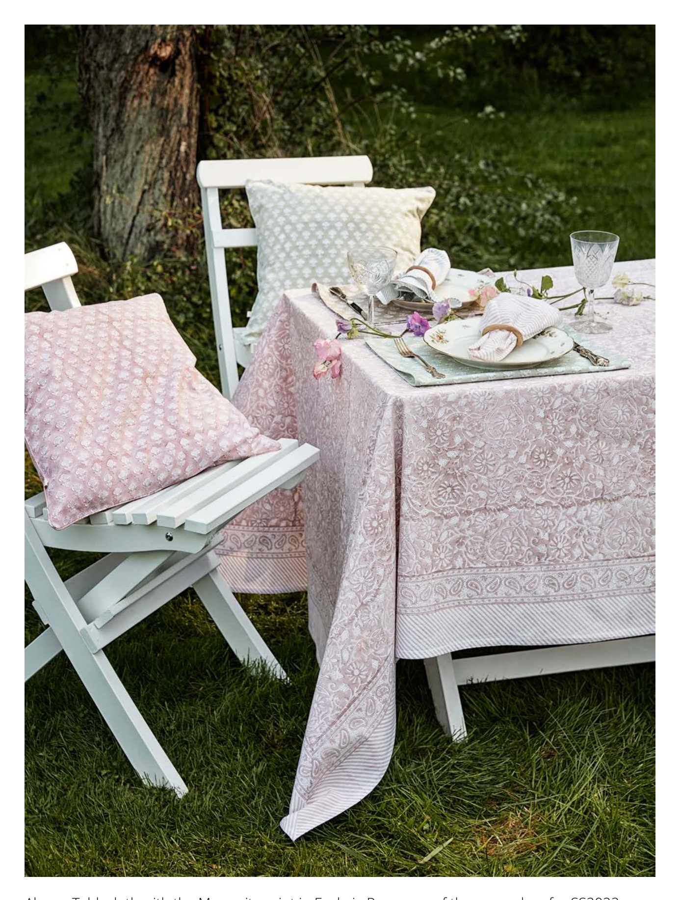
Above: Tablecloth with the Margerita print in Fuchsia Rose, one of the new colors for SS2022. Left: Margerita tablecloth with Fiori placemats in Sea Foam and Light Brown, matching Stripe napkins and napkin rings in guava wood.