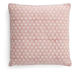
Cushion Cover Fiori Fuchsia Rose 100% Cotton