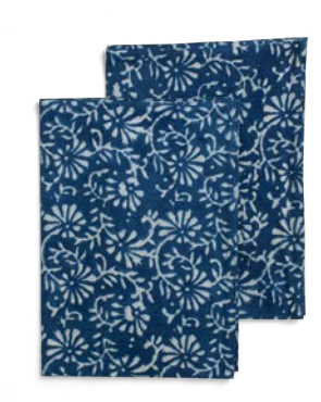
Kitchen Towels (set of 2) Indigo Aster 100% Cotton