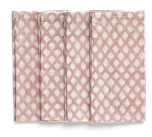
Napkins (set of 4) Medallion Fuchsia Rose 100% Cotton

CA2741 – 150 x 230 cm CA2742 – 170 x 270 cm CA2743 – 150 x 350 cm