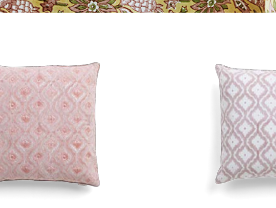
Cushion Cover Diamond Fuchsia Rose 100% Cotton