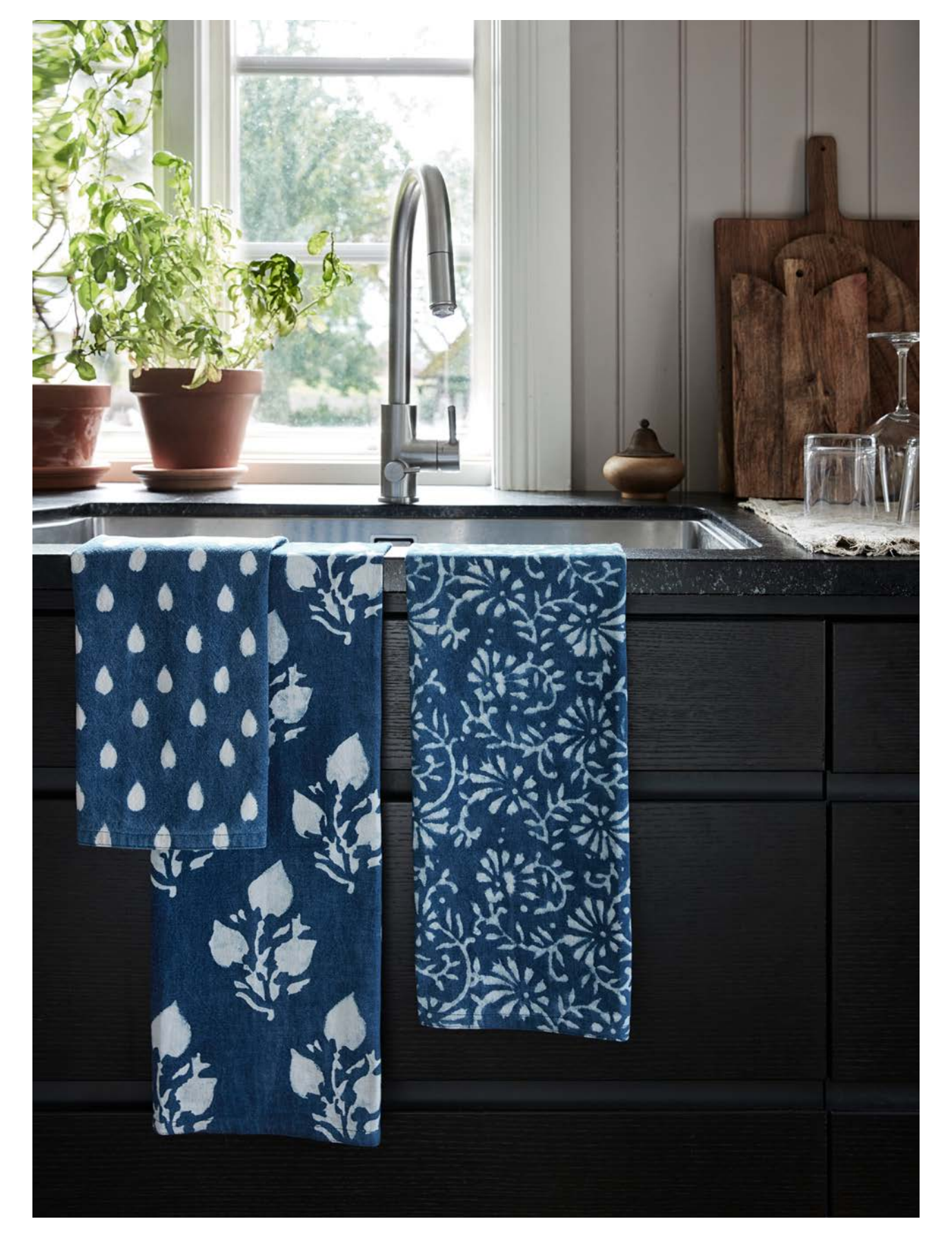
Above: Kitchen towels in the three different indigo patterns - Drop, Leaf and Aster. Sold in package of two.