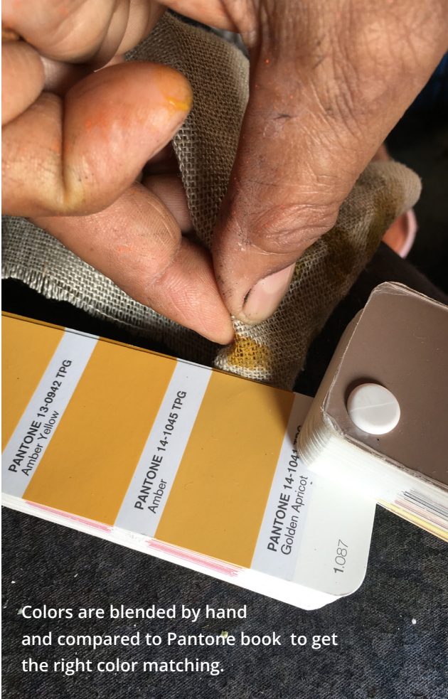
We are proud to preserve this ancient craft and bring it into modern homes.

Most of Chamois textiles are handprinted using the ancient woodblock printing technique. We develop our prints in collaboration with local artisans and family run businesses. The whole process is made by hand from cutting of the woodblocks and blending the colors to printing each textile. The process is gentle on the environment, use very little water and electricity.