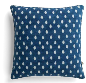
Cushion Cover Indigo Drop 100% Cotton