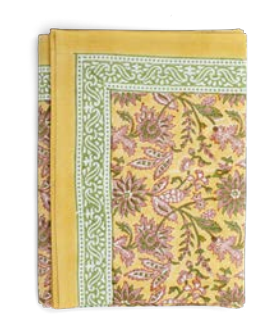
Tablecloth Indian Summer Easter 100% Cotton

CA2887 – 160 x 160 cm CA2888 – 150 x 230 cm CA2889 – 170 x 270 cm CA2890 – 150 x 350 cm