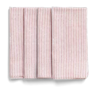
Napkins (set of 4) Stripe Fuchsia Rose 100% Cotton