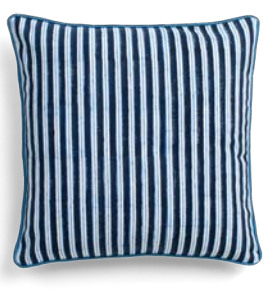
Cushion Cover Indian Stripe Navy Blue 100% Cotton