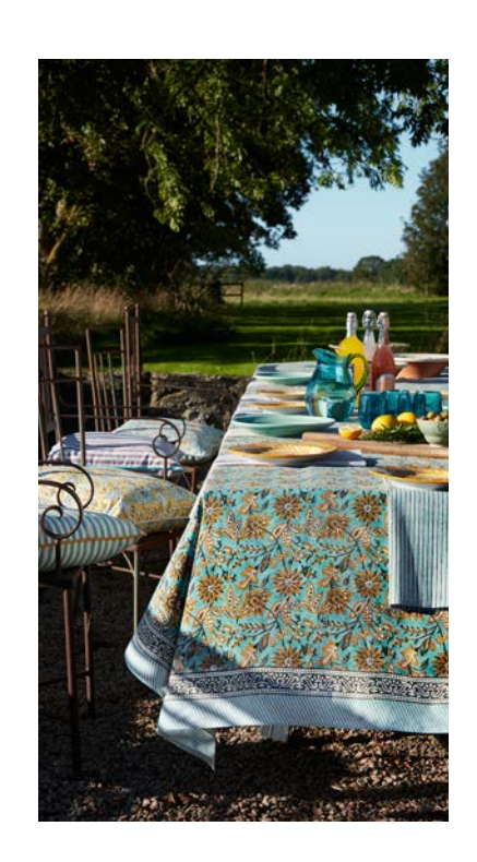
16 Indian Summer