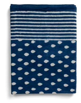
Tablecloth Indigo Drop 100% Cotton

CA2966 – 150 x 230 cm CA2967 – 170 x 270 cm CA2968 – 150 x 350 cm