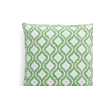
Cushion Cover Diamond Green 100% Cotton