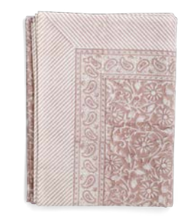
Tablecloth Margerita Fuchsia Rose 100% Cotton

CA3003 – 150 x 230 cm CA3004 – 170 x 270 cm CA3005 – 150 x 350 cm