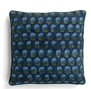
Cushion Cover Sunflower Navy Blue 100% Cotton