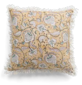
Cushion Cover Pomegranate Ochre 100% Cotton