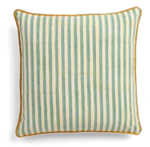
Cushion Cover Indian Stripe Yellow & Sea Foam 100% Cotton

CA2944 – 150 x 230 cm CA2945 – 170 x 270 cm CA2946 – 150 x 350 cm