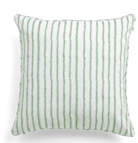
Cushion Cover Electric Stripe Green 100% Cotton