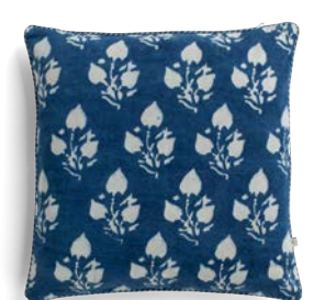
Cushion Cover Indigo Leaf 100% Cotton