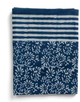
Tablecloth Indigo Aster

CA2963 – 150 x 230 cm CA2964 – 170 x 270 cm CA2965 – 150 x 350 cm