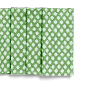
Napkins (set of 4) Medallion Green 100% Cotton

CA2414 – 160 x 160 cm CA2415 – 150 x 230 cm CA2416 – 170 x 270 cm CA2417 – 150 x 350 cm