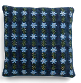
Cushion Cover Garland Navy Blue 100% Cotton