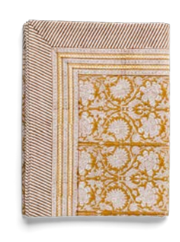
Tablecloth Paradise Lion Yellow 100% Cotton

CA2414 – 160 x 160 cm CA2415 – 150 x 230 cm CA2416 – 170 x 270 cm CA2417 – 150 x 350 cm