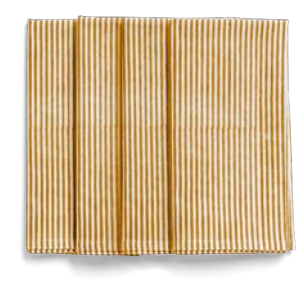
Napkins (set of 4) Stripe Lion Yellow 100% Cotton