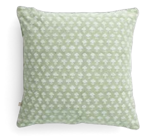
Cushion Cover Fiori Sea Foam 100% Cotton