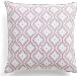
Cushion Cover Diamond Plain Fuchsia Rose 100% Cotton