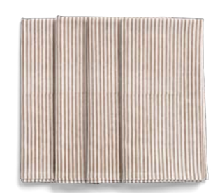
Napkins (set of 4) Stripe Light Brown 100% Cotton

CA3006 – 150 x 230 cm CA3007 – 170 x 270 cm CA3010 – 150 x 350 cm