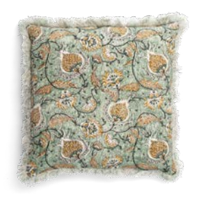
Cushion Cover Pomegranate Sea Foam 100% Linen

CA2698 – 150 x 230 cm CA2699 – 170 x 270 cm CA2700 – 150 x 350 cm